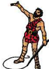
AECI 0107 / 2900 Sts