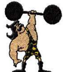
AECI 0110 / 4200 Sts