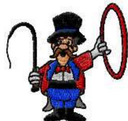
AECI 0108 / 4900 Sts