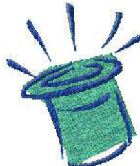
AECI 0113 / 3300 Sts