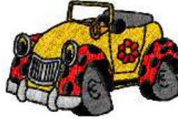
AECI 0103 / 6500 Sts