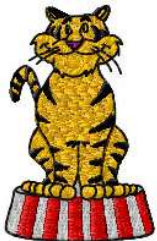
AECI 0111 / 6800 Sts