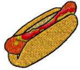
AECI 0105 / 3900 Sts