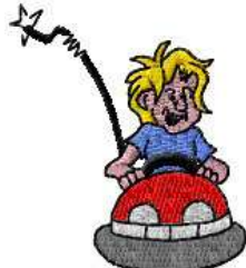
AECI 0117 / 4600 Sts