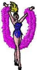
AECI 0121 / 3400 Sts