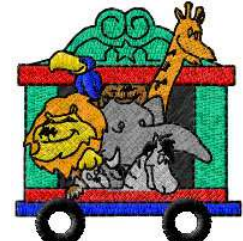
AECI 0120 / 12400 Sts