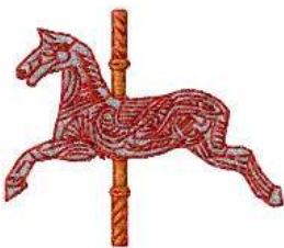
AECI 0116 / 3700 Sts