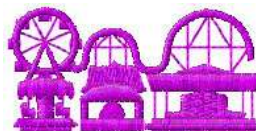
AECI 0123 / 3600 Sts