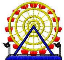
AECI 0115 / 5200 Sts