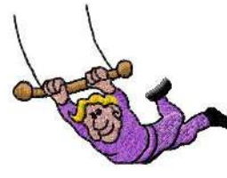
AECI 0119 / 3000 Sts