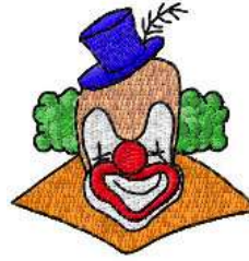
AECI 0104 / 6100 Sts