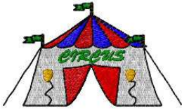
AECI 0101 / 6400 Sts