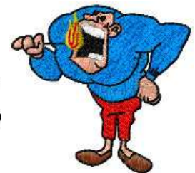
AECI 0125 / 5400 Sts