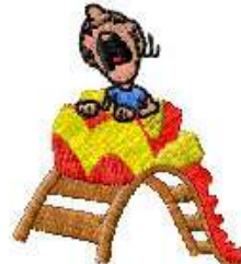
AECI 0118 / 3500 Sts