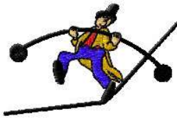
AECI 0112 / 3600 Sts