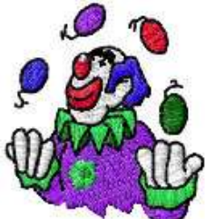
AECI 0106 / 4800 Sts