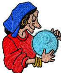
AECI 0114 / 7100 Sts