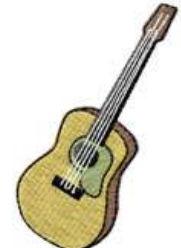
AEMU 0110 / 2700 Sts

1: 1 Grey 2: 2 Black 3: 3 White 4: 2 Black 5: 4 Gold 6: 1 Grey