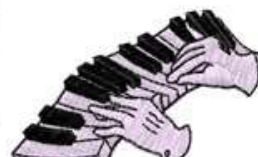
AEMU 0124 / 4500 Sts

1: 1 Black 2: 2 Red 3: 3 Blue 4: 4 Green 5: 5 Gold 6: 6 Purple 7: 1 Black