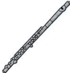
AEMU 0107 / 1400 Sts

1: 1 Red 2: 2 Silver 3: 3 Black 4: 4 White 5: 1 Red