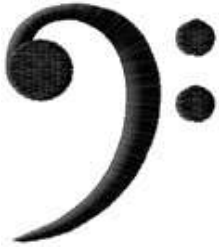
AEMU 0101 / 1000 Sts