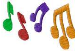
AEMU 0103 / 1900 Sts

1: 1 Green 2: 2 Red 3: 3 Blue 4: 4 Orange 5: 1 Green