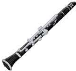
AEMU 0102 / 1800 Sts