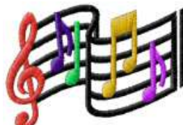
AEMU 0123 / 3500 Sts

1: 1 Brown 2: 2 Dark Brown 3: 3 Black 4: 4 White 5: 1 Brown