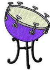
AEMU 0104 / 4500 Sts

1: 1 Green 2: 2 Red 3: 3 Blue 4: 4 Orange 5: 1 Green