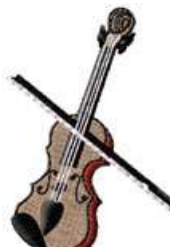
AEMU 0122 / 2700 Sts

1: 1 Gold 2: 2 White 3: 3 Black 4: 1 Gold