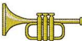
AEMU 0121 / 2100 Sts

1: 1 Gold 2: 2 White 3: 3 Black 4: 1 Gold