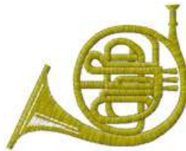
AEMU 0108 / 3400 Sts