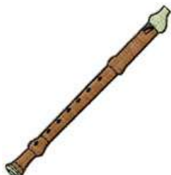
AEMU 0116 / 1300 Sts

1: 1 Brown 2: 2 Cream 3: 3 Black 4: 1 Brown