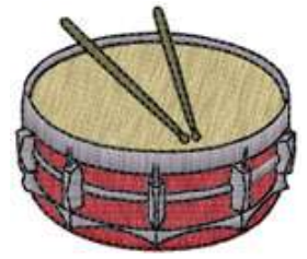
AEMU 0105 / 6400 Sts

1: 1 Black 2: 2 Cream 3: 3 Blue 4: 4 Grey 5: 1 Black