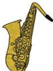
AEMU 0117 / 3100 Sts

1: 1 Brown 2: 2 Cream 3: 3 Black 4: 1 Brown