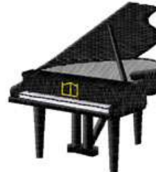
AEMU 0109 / 3900 Sts

1: 1 Grey 2: 2 Black 3: 3 White 4: 2 Black 5: 4 Gold 6: 1 Grey