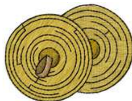
AEMU 0118 / 5200 Sts

1: 1 Gold 2: 2 Dark Gold 3: 3 Dark Brown 4: 4 Brown 5: 5 Black 6: 1 Gold