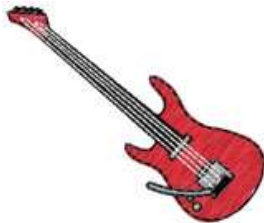
AEMU 0106 / 2300 Sts

1: 1 Tan 2: 2 Red 3: 3 Grey 4: 4 Brown 5: 5 Black 6: 1 Tan