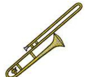
AEMU 0120 / 2000 Sts

1: 1 Gold 2: 2 White 3: 3 Black 4: 1 Gold