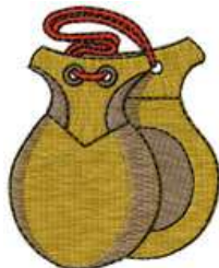
AEMU 0112 / 6300 Sts

1: 1 Gold 2: 2 Black 3: 3 White 4: 1 Gold