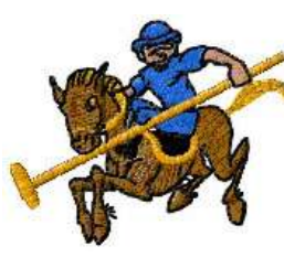
ANHO 0103 / 5400 Sts

1: 1 Body Colour 2: 2 Black 3: 3 White Highlights 4: 1 Body Colour