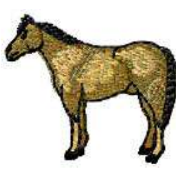
ANHO 0117 / 3600 Sts

1: 1 Body Colour 2: 2 Lt. Patches 3: 3 Mane & Detail 4: 1 Body Colour