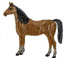
ANHO 0120 / 6300 Sts

1: 1 Light Brown 2: 2 Light Pink 3: 3 Dark Pink 4: 4 Black 5: 1 Light Brown