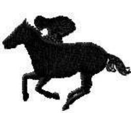
ANHO 0111 / 2000 Sts

1: 1 Dark Grey 2: 2 Light Grey 3: 3 Black 4: 1 Dark Grey