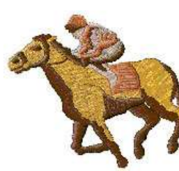
ANHO 0119 / 4600 Sts

1: 1 Brown 2: 2 Green 3: 3 Beige 4: 4 Red 5: 5 Black 6: 1 Brown