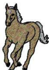
ANHO 0122 / 4000 Sts

1: 1 Brown 2: 2 Flesh 3: 3 Red 4: 4 Blue 5: 5 Light Brown 6: 6 Black 7: 1 Brown