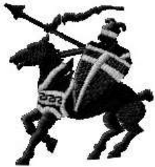
ANHO 0101 / 4100 Sts