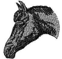
ANHO 0110 / 5900 Sts

1: 1 Grey (Shoe) 2: 2 Light Brown 3: 3 White 4: 4 Dark Brown 5: 5 Black (Detail) 6: 1 Grey (Shoe) 7: 5 Black (Detail) 8: 1 Grey (Shoe)