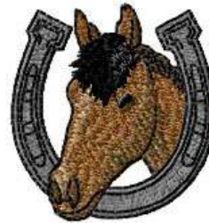
ANHO 0109 / 7400 Sts

1: 1 Light Grey 2: 2 Dark Grey 3: 3 Green 4: 4 Flesh 5: 5 Red 6: 6 Brown 7: 7 Black 8: 1 Light Grey