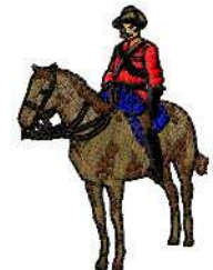
ANHO 0115 / 7800 Sts

1: 1 Brown 2: 2 Saddle 3: 3 Jodhpurs 4: 4 Flesh 5: 5 Coat 6: 6 Black 7: 1 Brown