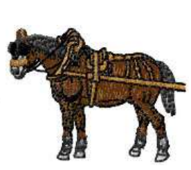
ANHO 0125 / 6400 Sts

1: 1 Dark Brown 2: 2 Light Brown 3: 3 Light Cream 4: 4 Flesh 5: 5 Jacket Colour 6: 6 Black 7: 7 White 8: 1 Dark Brown