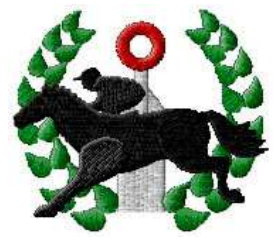
ANHO 0105 / 5200 Sts

1: 1 White 2: 2 Red 3: 3 Green 4: 4 Black 5: 1 White