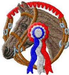
ANHO 0106 / 12100 Sts

1: 1 White 2: 2 Red 3: 3 Green 4: 4 Black 5: 1 White