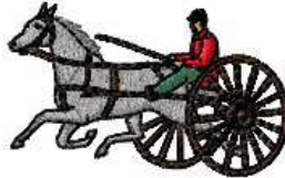
ANHO 0108 / 7600 Sts

1: 1 Light Grey 2: 2 Dark Grey 3: 3 Green 4: 4 Flesh 5: 5 Red 6: 6 Brown 7: 7 Black 8: 1 Light Grey