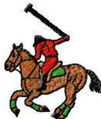
ANHO 0118 / 3800 Sts

1: 1 Body Colour 2: 2 Lt. Patches 3: 3 Mane & Detail 4: 1 Body Colour