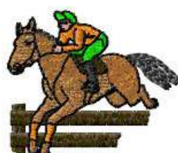
ANHO 0113 / 5300 Sts

1: 1 Brown 2: 2 Dark Brown 3: 3 Reins+Saddle 4: 4 Trousers 5: 5 Flesh 6: 6 Red 7: 7 White 8: 8 Black 9: 7 White 10: 1 Brown