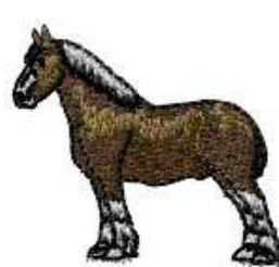
ANHO 0123 / 4600 Sts

1: 1 Mane/Tail 2: 2 Body 3: 3 Outline/Detail 4: 1 Mane/Tail