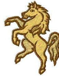
ANHO 0104 / 7700 Sts

1: 1 Brown 2: 2 Flesh 3: 3 Light Blue 4: 4 Black 5: 5 Light Brown 6: 4 Black 7: 1 Brown