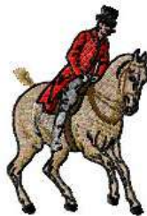
ANHO 0112 / 5400 Sts

1: 1 Brown 2: 2 Dark Brown 3: 3 Reins+Saddle 4: 4 Trousers 5: 5 Flesh 6: 6 Red 7: 7 White 8: 8 Black 9: 7 White 10: 1 Brown