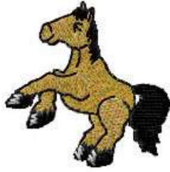
ANHO 0102 / 3400 Sts

1: 1 Body Colour 2: 2 Black 3: 3 White Highlights 4: 1 Body Colour