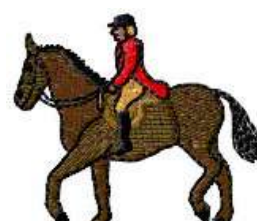
ANHO 0114 / 4200 Sts

1: 1 Fence/Saddle 2: 2 Mane/Tail 3: 3 Horse 4: 1 Fence/Saddle 5: 4 Flesh 6: 5 Cap/Legs 7: 6 Top/Ankle 8: 2 Mane/Tail 9: 7 Black 10: 1 Fence/Saddle