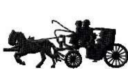
ANHO 0107 / 2700 Sts

1: 1 Brown 2: 2 White 3: 3 Red 4: 4 Light Horse 5: 5 Dark Horse 6: 6 Silver 7: 1 Brown 8: 6 Silver 9: 3 Red 10: 2 White 11: 7 Blue 12: 2 White 13: 8 Black 14: 1 Brown