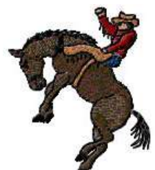
ANHO 0121 / 3700 Sts

1: 1 Lt. Grey 2: 2 Lt. Brown 3: 3 Dk. Brown 4: 4 Dk. Grey/Black