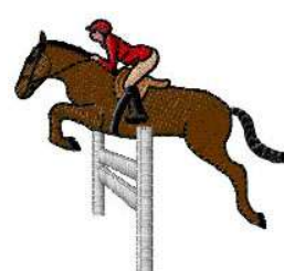
ANHO 0124 / 5100 Sts

1: 1 White 2: 2 Dark Grey 3: 3 Dark Brown 4: 2 Dark Grey 5: 4 Black 6: 5 Light Brown 7: 1 White