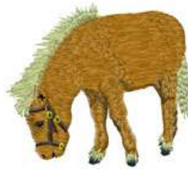
ANHO 0208 / 7300 Sts