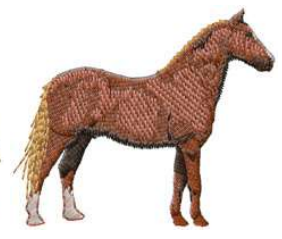
ANHO 0225 / 6100 Sts