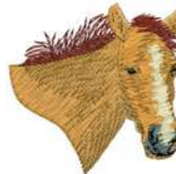
ANHO 0214 / 5600 Sts