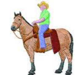
ANHO 0213 / 6800 Sts