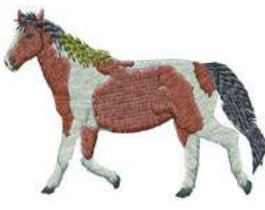
ANHO 0217 / 6700 Sts