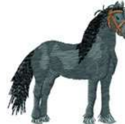
ANHO 0209 / 7600 Sts