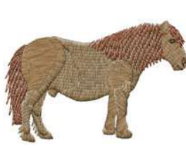
ANHO 0218 / 6100 Sts