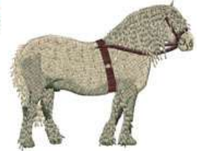
ANHO 0210 / 8100 Sts