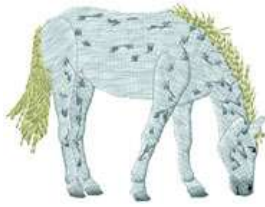
ANHO 0202 / 7900 Sts