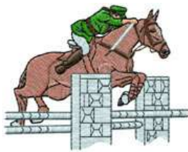
ANHO 0212 / 11300 Sts