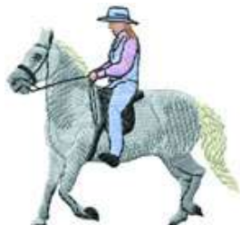
ANHO 0216 / 6600 Sts