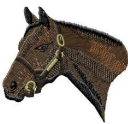
ANHO 0222 / 9100 Sts