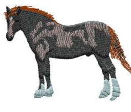
ANHO 0223 / 7000 Sts