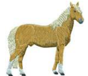
ANHO 0215 / 5500 Sts