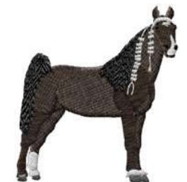
ANHO 0221 / 6800 Sts