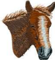
ANHO 0207 / 5200 Sts