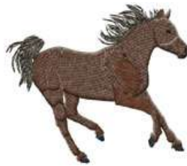
ANHO 0203 / 5200 Sts