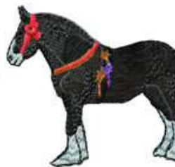
ANHO 0219 / 8400 Sts