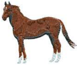
ANHO 0201 / 5500 Sts