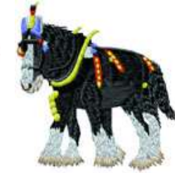
ANHO 0204 / 9500 Sts