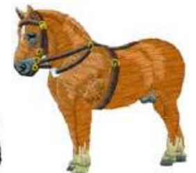
ANHO 0220 / 7700 Sts