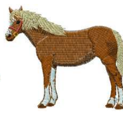
ANHO 0224 / 5900 Sts