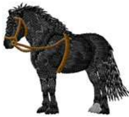
ANHO 0206 / 8900 Sts