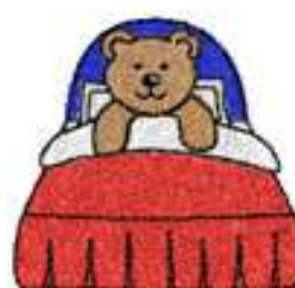
CHTE 0224 / 6800 Sts