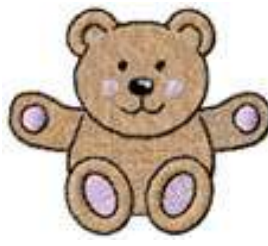
CHTE 0203 / 6000 Sts