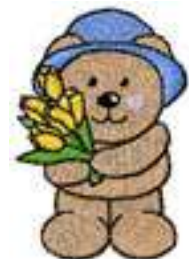
CHTE 0216 / 6100 Sts