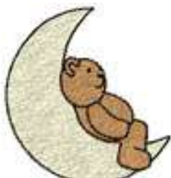
CHTE 0222 / 4900 Sts