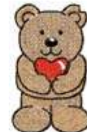
CHTE 0219 / 5400 Sts