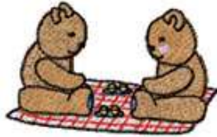
CHTE 0212 / 5400 Sts