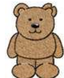
CHTE 0221 / 5100 Sts