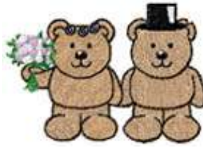
CHTE 0208 / 9200 Sts