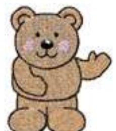
CHTE 0225 / 5200 Sts