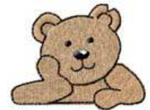
CHTE 0215 / 4500 Sts