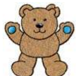
CHTE 0220 / 5500 Sts