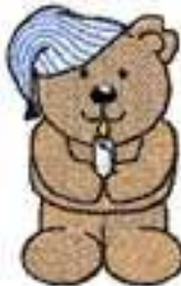
CHTE 0207 / 6100 Sts