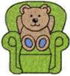
CHTE 0201 / 8200 Sts