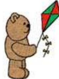
CHTE 0214 / 4300 Sts