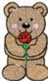
CHTE 0218 / 5700 Sts