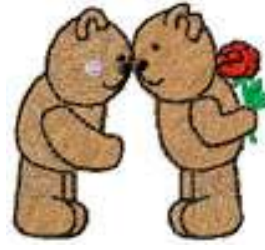
CHTE 0204 / 6100 Sts