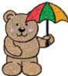
CHTE 0211 / 5600 Sts