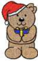
CHTE 0202 / 6200 Sts