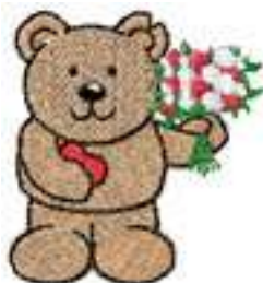
CHTE 0217 / 6400 Sts