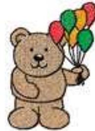
CHTE 0209 / 5700 Sts