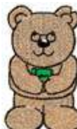
CHTE 0223 / 5400 Sts