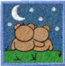
CHTE 0206 / 10200 Sts