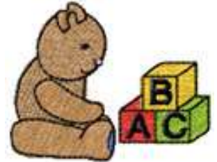
CHTE 0210 / 4700 Sts