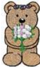
CHTE 0213 / 7400 Sts