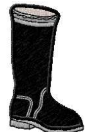
FAHS 0125 / 5800 Sts

1: 1 Beige 2: 2 Mid Brown 3: 3 Dark Brown 4: 1 Beige