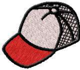
FAHS 0102 / 6200 Sts

1: 1 White 2: 2 Blue 3: 3 Black 4: 1 White