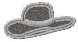
FAHS 0120 / 4400 Sts

1: 1 Dark Grey 2: 2 Light Grey 3: 1 Dark Grey