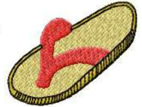
FAHS 0110 / 4800 Sts

1: 1 Dark Red 2: 2 Black 3: 3 Red 4: 1 Dark Red