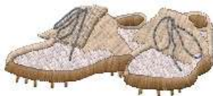
FAHS 0111 / 4500 Sts

1: 1 Yellow 2: 2 Red 3: 3 Dark Yellow 4: 4 Black 5: 1 Yellow