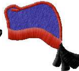
FAHS 0119 / 3500 Sts