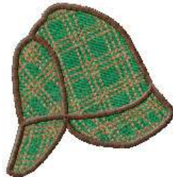
FAHS 0107 / 8100 Sts

1: 1 Brown 2: 2 Dark Brown 3: 3 Black 4: 1 Brown