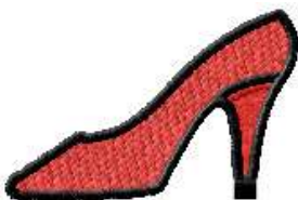
FAHS 0121 / 3100 Sts

1: 1 Dark Grey 2: 2 Light Grey 3: 1 Dark Grey