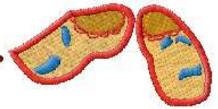
FAHS 0105 / 4300 Sts

1: 1 Green 2: 2 Dark Brown 3: 3 Brown 4: 1 Green