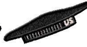
FAHS 0114 / 3500 Sts