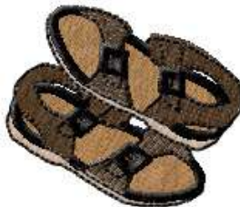
FAHS 0117 / 7500 Sts

1: 1 Mid Brown 2: 2 Dark Brown 3: 3 Light Brown 4: 4 Black 5: 1 Mid Brown