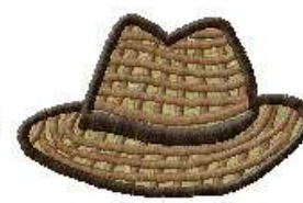
FAHS 0124 / 8400 Sts

1: 1 Blue 2: 2 White 3: 3 Dark Blue 4: 4 Grey 5: 1 Blue