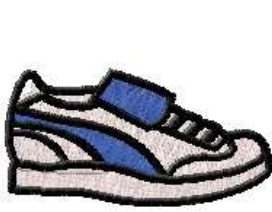
FAHS 0101 / 7000 Sts

1: 1 White 2: 2 Blue 3: 3 Black 4: 1 White