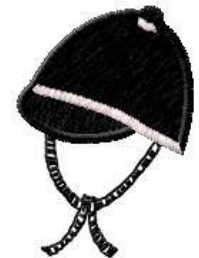
FAHS 0115 / 3800 Sts