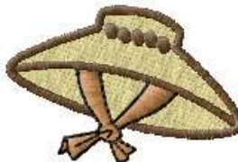
FAHS 0112 / 4300 Sts

1: 1 White 2: 2 Light Brown 3: 3 Brown 4: 4 Grey 5: 1 White