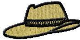
FAHS 0113 / 4100 Sts

1: 1 Cream 2: 2 Brown 3: 3 Dark Brown 4: 4 Black 5: 1 Cream