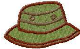
FAHS 0104 / 5200 Sts

1: 1 White 2: 2 Blue 3: 1 White 4: 3 Black 5: 1 White