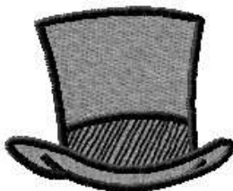
FAHS 0122 / 5500 Sts