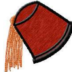
FAHS 0109 / 5000 Sts

1: 1 Black 2: 2 Orange 3: 3 Silver 4: 1 Black