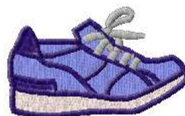
FAHS 0123 / 6700 Sts

1: 1 Blue 2: 2 White 3: 3 Dark Blue 4: 4 Grey 5: 1 Blue