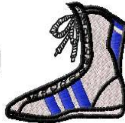
FAHS 0103 / 7100 Sts

1: 1 White 2: 2 Red 3: 3 Black 4: 1 White