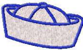
FAHS 0116 / 5500 Sts