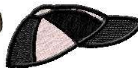
FAHS 0118 / 4500 Sts

1: 1 Mid Brown 2: 2 Dark Brown 3: 3 Light Brown 4: 4 Black 5: 1 Mid Brown