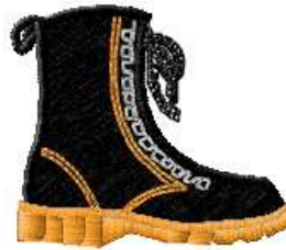
FAHS 0108 / 5300 Sts

1: 1 Green 2: 2 Brown 3: 3 Dark Brown 4: 1 Green