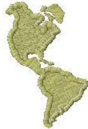
NORTH &amp; SOUTH AMERICA